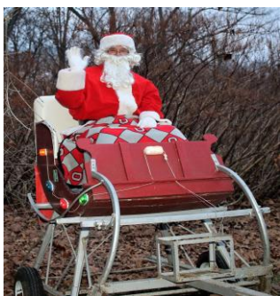
route 12, santa ready to go!

A million thanks to everyone who participated in any way; our Santa's, our Police Officers, our sleigh pullers, our kitchen helpers; every single one of our over 150 volunteers needed to make our Christmas Eve event a success. Over 3,000 gifts were delivered to the children of the Portage Lakes/New Franklin area. There was a great piece on the news by WKYC Channel 3 with many photo's on the social media sites PLX Rocks and Portage Lakes Rocks as well as a few others.